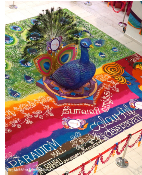
Paradigm Mall JB