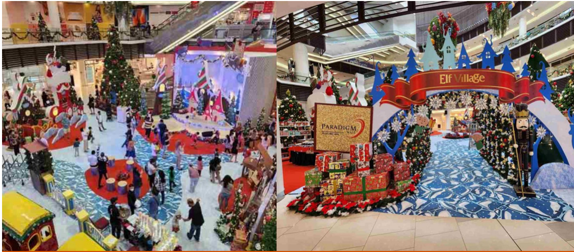
Paradigm Mall PJ