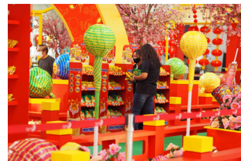
Paradigm Mall JB