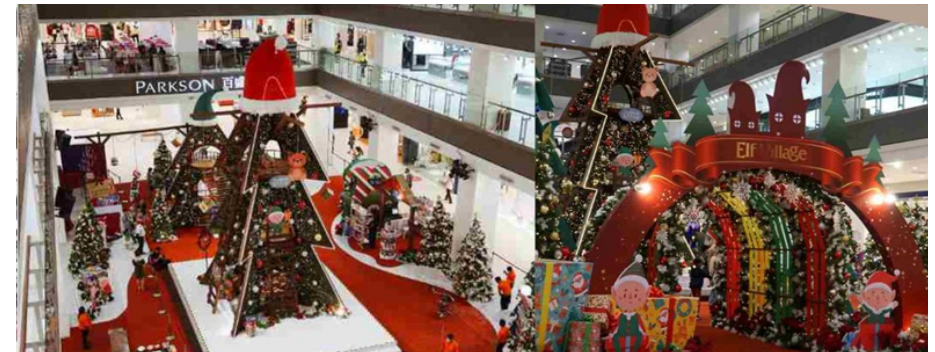
Paradigm Mall JB

WCT Malls were transformed into a magical Elf Village to usher the most wonderful time of the year. Each mall was decked with a 3D pop-up storybook, Christmas Elf train and slide targeting the kids, alongside Christmas trees, Elves, colorful lights, and various Christmas booths selling Christmas gifts and cookies. On top of the tempting year-end sales, the respective malls also prepared a series of exciting activities and performances – all for a wonderful family outing experience!