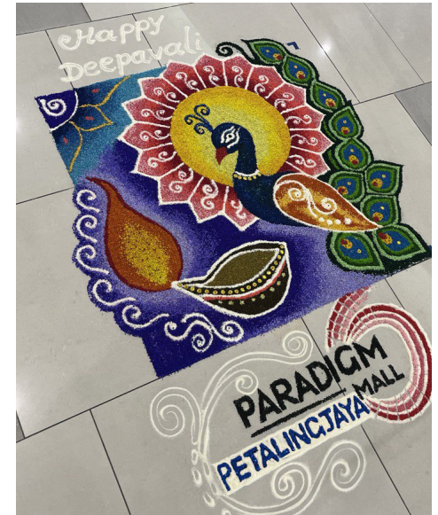
Paradigm Mall PJ