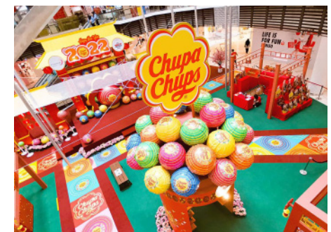
Paradigm Mall PJ