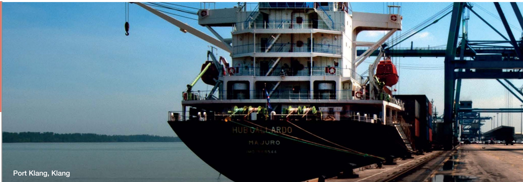
Port Klang, Klang