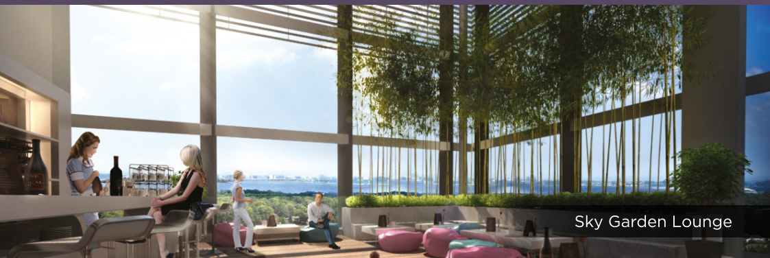
Sky Garden Lounge