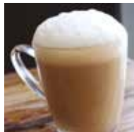
Lot 2F 25, Level 2