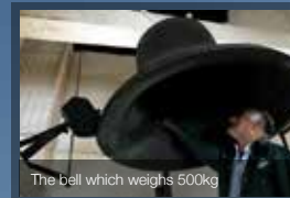
The bell which weighs 500kg

The clock tower has never missed a chime in its 116 years of existence.