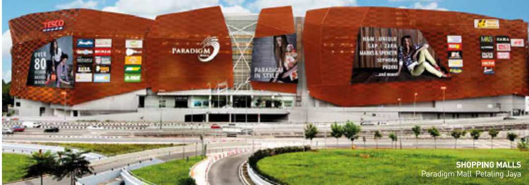
SHOPPING MALLS Paradigm Mall, Petaling Jaya

Newly streamlined and newly reorganised, our same dedicated team pledges to deliver the same high standards of excellence which have come to be expected of us.