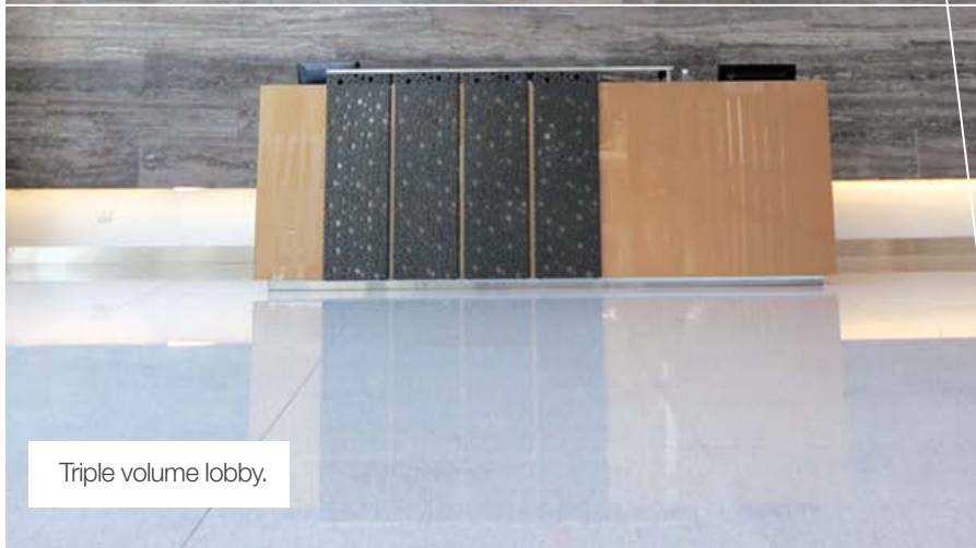
Triple volume lobby.