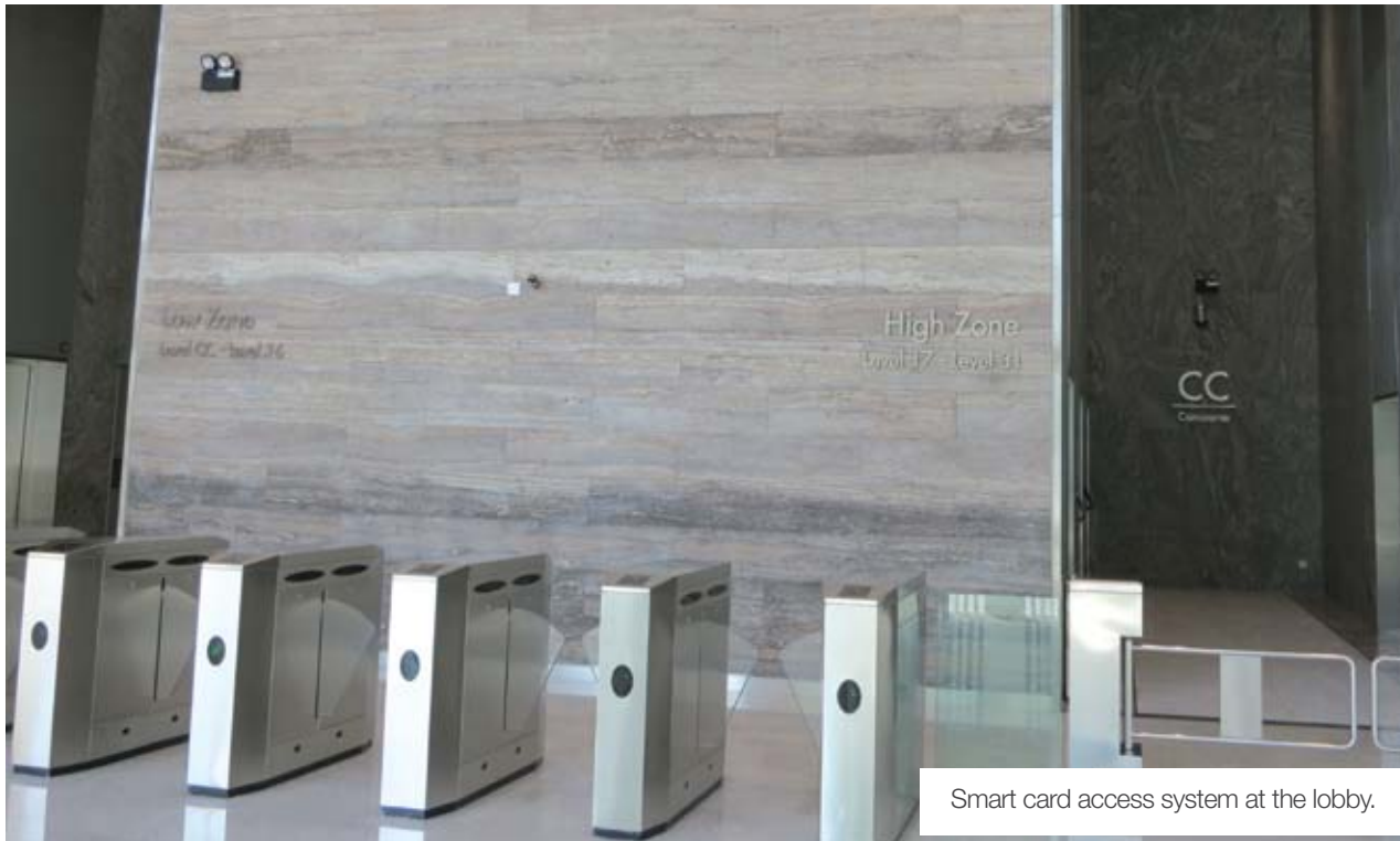
Smart card access system at the lobby.

This 32-floor corporate tower enjoys high visibility of the Damansara-Puchong Highway (LDP) and is imbued with prestigious elements that make up a sophisticated corporate landmark. Built to MSC Cybercentre Status specified accreditation, The Ascent is seamlessly integrated with Paradigm Mall, New World Petaling Jaya Hotel, and The Azure Residences – where shopping, dining, and entertainment converge.