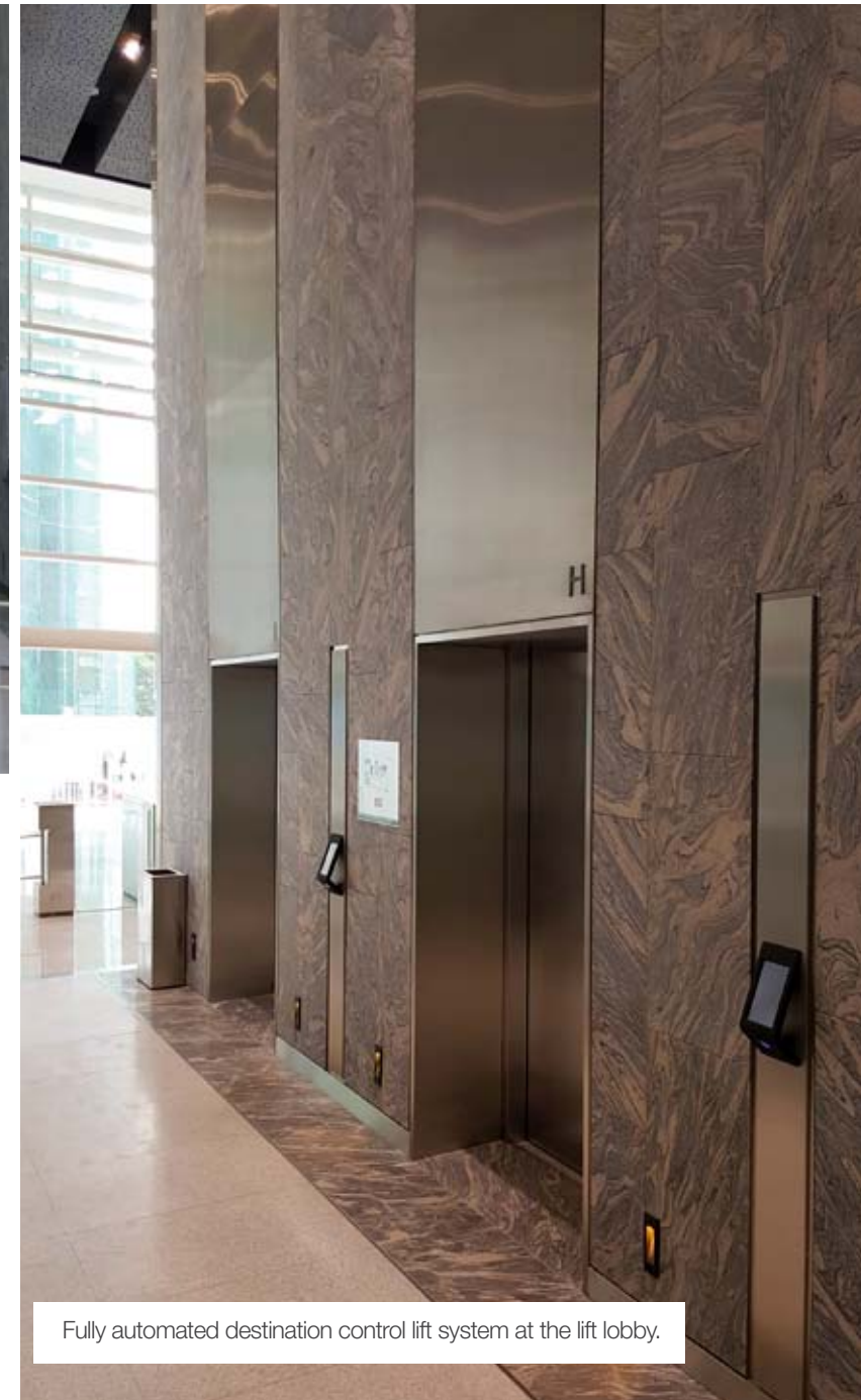
Fully automated destination control lift system at the lift lobby.

With a total net lettable area of approximately 505,000 sq ft, The Ascent takes great pride in being one of the largest floor plates available in Petaling Jaya. Each floor measures at approximately 18,000 sq ft and office sizes typically range from 5,000 sq ft to 18,000 sq ft. A column-free layout offers maximum efficiency and flexibility, while other perks such as ample parking bays, integrated access to key points, a dedicated underpass, and the tower's wide spectrum of amenities and facilities have allowed it to emerge the best in functionality, versatility, and style. The tower also features a fully automated destination control lift system and high speed broadband infrastructure – complementary features to what can already be considered one of Petaling Jaya's corporate gems.