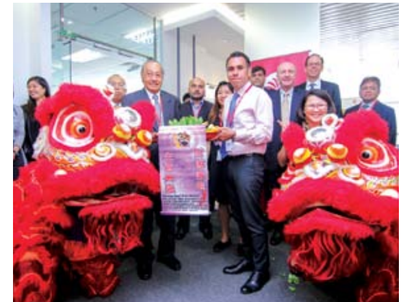
The management and staff of DKSH during the official move-in celebrations.

The Ascent welcomed its first tenant – DKSH Malaysia in early June 2015. The company occupies over 7 floors and involved the relocation of over 1,200 employees to The Ascent in an effort to further strengthen the company's position as an employer of choice.