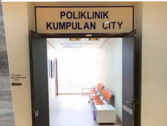
The Ascent's second tenant, Poliklinik Kumpulan City is located on the 17 th floor.