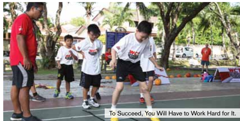
To Succeed, You Will Have to Work Hard for It.