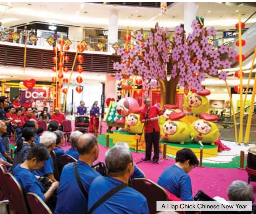
A HapiChick Chinese New Year