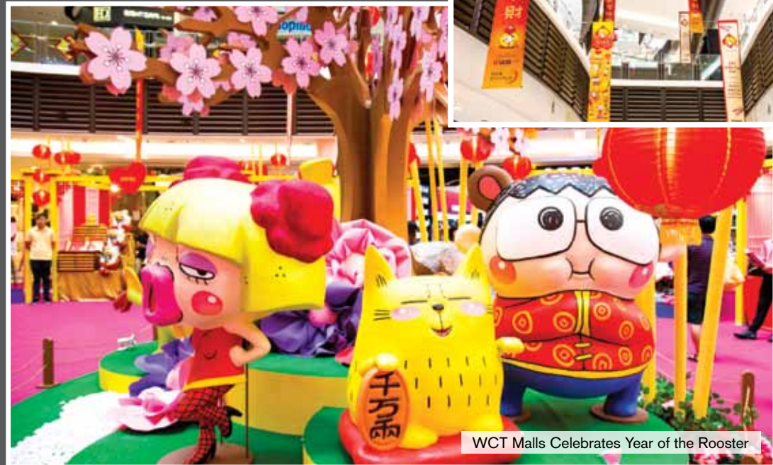
WCT Malls Celebrates Year of the Rooster