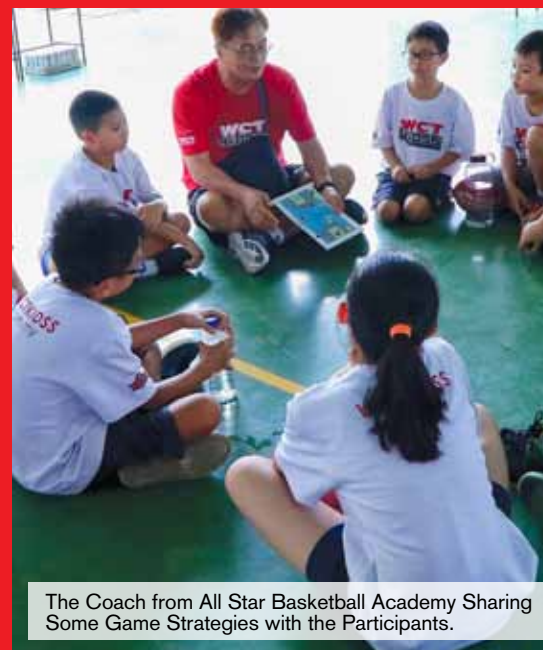
The Coach from All Star Basketball Academy Sharing Some Game Strategies with the Participants.