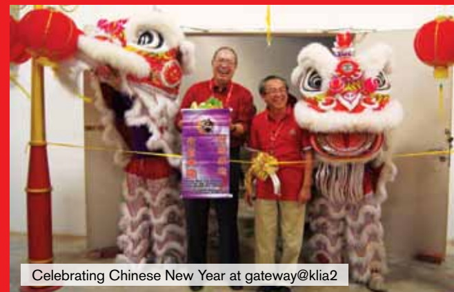
Celebrating Chinese New Year at gateway@klia2