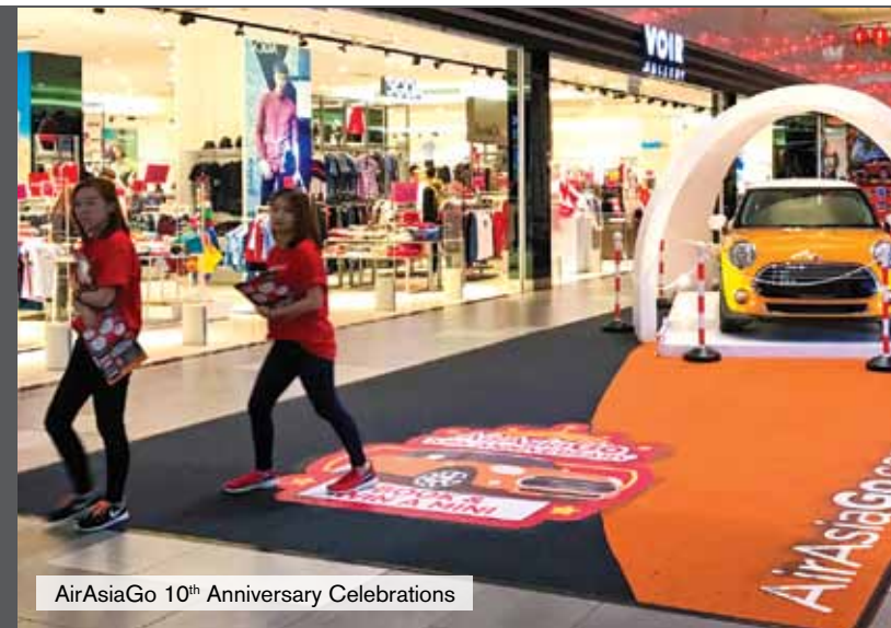
AirAsiaGo 10 th Anniversary Celebrations

Apart from the nationwide online contest, game booths were also set up at gateway@klia2 for shoppers to participate in games and also to get more information on the on-going contest.