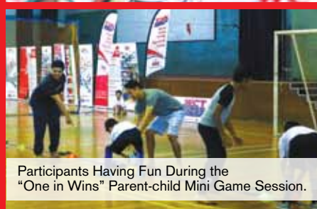
Participants Having Fun During the "One in Wins" Parent-child Mini Game Session.