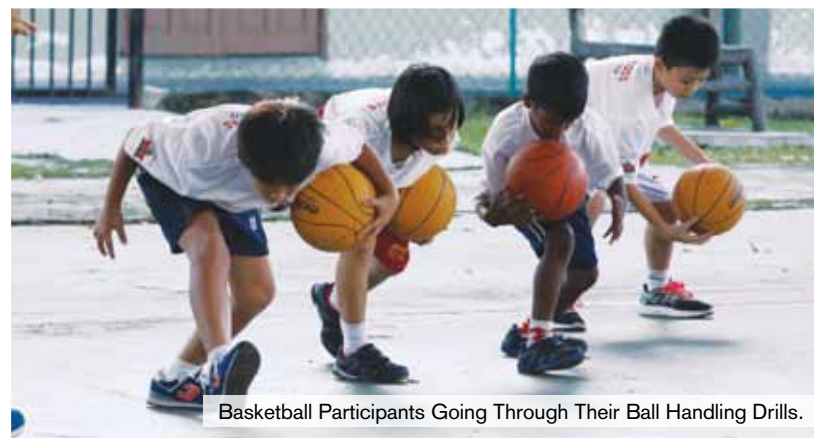
Basketball Participants Going Through Their Ball Handling Drills.