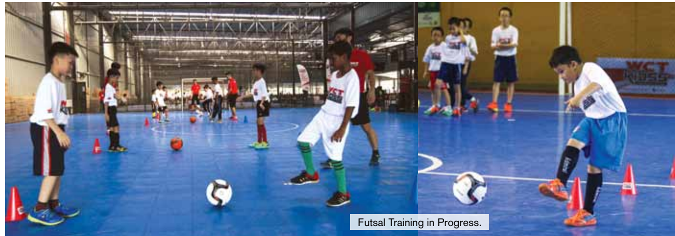
Futsal Training in Progress.

Coaches on board for the WCT KIDSS 2017 Programme were nationally qualified and well-recognised coaches from the Subang Jaya Youth Academy and All Star Basketball Academy. WCT has been working together with All Star Basketball Academy for its WCT KIDSS Basketball Programme since the inception of this initiative.