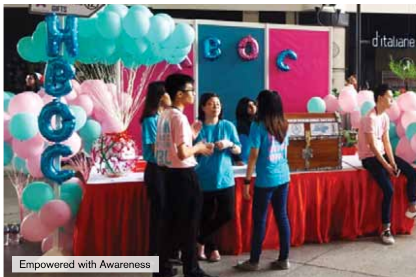
Empowered with Awareness

HBOC is an inherited genetic condition caused by faulty genes which can be passed down from each generation to the next and could cause other types of cancer affecting both men and women. Hence, early detection is crucial to save lives. This meaningful campaign supported by Paradigm Mall Petaling Jaya has successfully increased public awareness about HBOC.