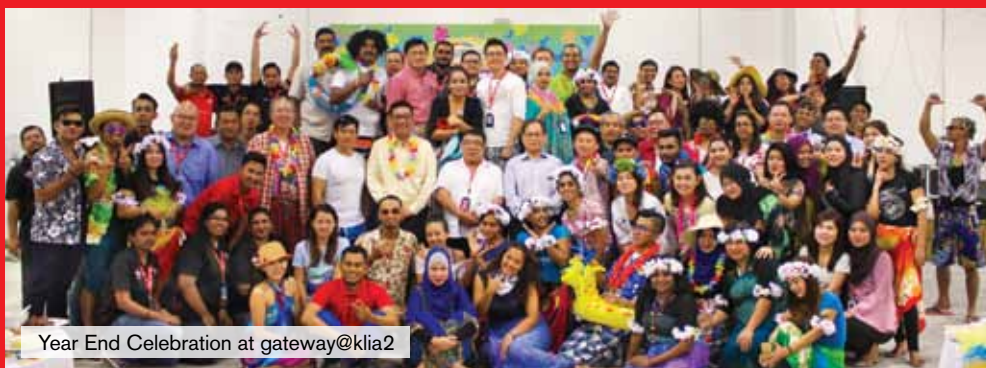
Year End Celebration at gateway@klia2