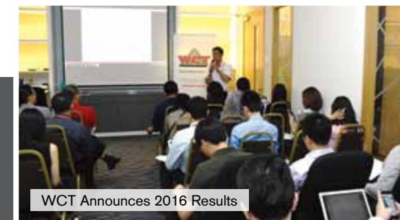
WCT Announces 2016 Results