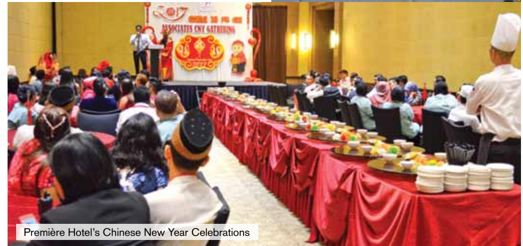
Première Hotel's Chinese New Year Celebrations