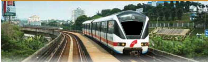
Proposed Station 24, LRT3 Target Completion by 2020

the LEAD Residences @ Bukit Tinggi 2 is the only Service Apartments directly linked to AEON Bukit Tinggi Shopping Centre in Klang.