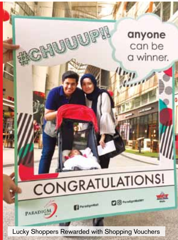
Lucky Shoppers Rewarded with Shopping Vouchers

Two random shoppers were selected every Saturday and Sunday during the campaign period and they were awarded cash vouchers worth at least RM50 to spend at participating outlets such as A-Saloon, BarBQ Plaza, Purple Cane Tea Restaurant, Royal Sporting House and many more.