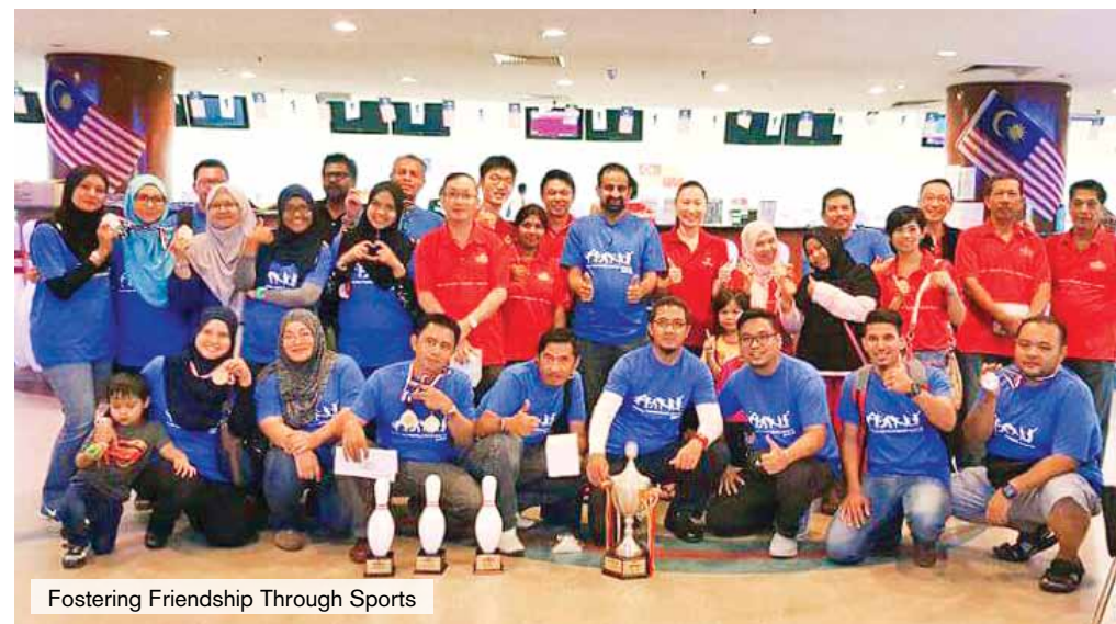
Fostering Friendship Through Sports