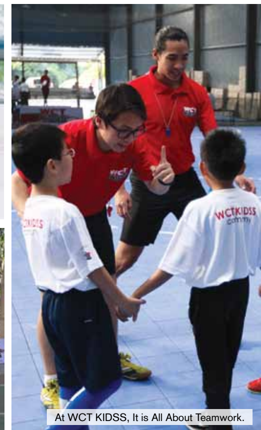
At WCT KIDSS, It is All About Teamwork.