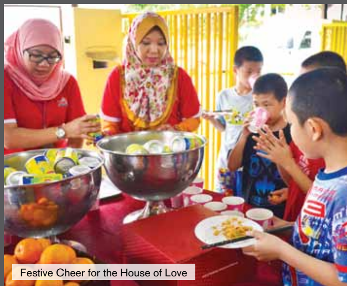
Festive Cheer for the House of Love

The children and guardians were also given angpows , necessities and consumables sponsored by the hotel. It was a truly joyful day for all who were involved.