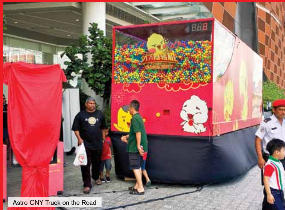
Astro CNY Truck on the Road

In conjunction with the Chinese New Year celebration, Astro brought the festivities to the shoppers of Paradigm Mall Petaling Jaya by showcasing its very own Astro CNY truck. Parked in front of the mall's entrance at Level G, shoppers had the opportunity to win limited edition miniature plush toys by participating in interactive games. Astro CNY's mascot, Zhuan Ji was also present to entertain the children.