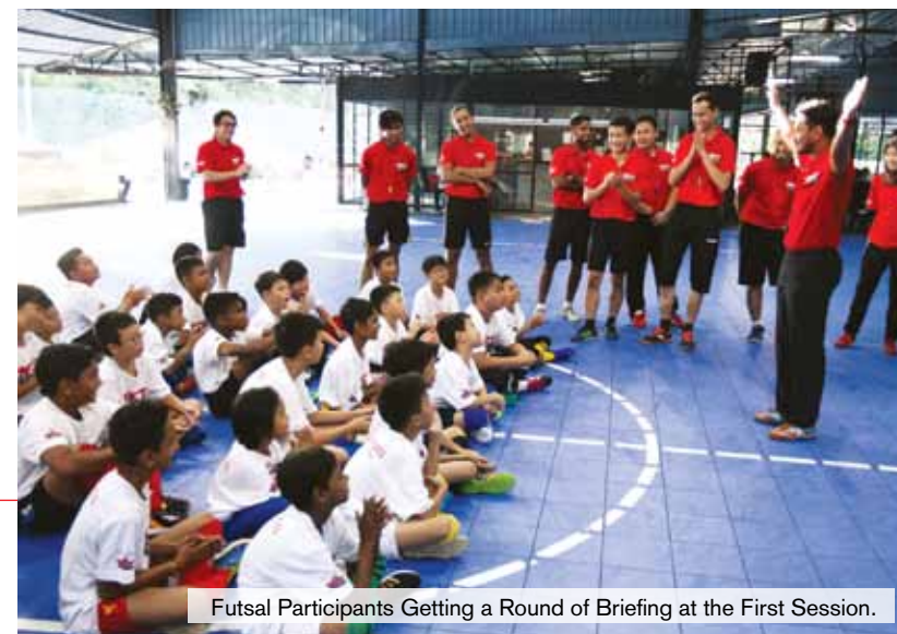
Futsal Participants Getting a Round of Briefing at the First Session.