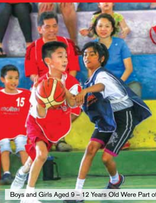
Boys and Girls Aged 9 – 12 Years Old Were Part of the Month-long Programme.