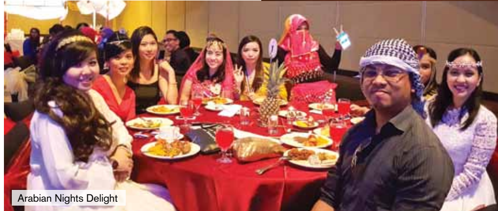
Arabian Nights Delight