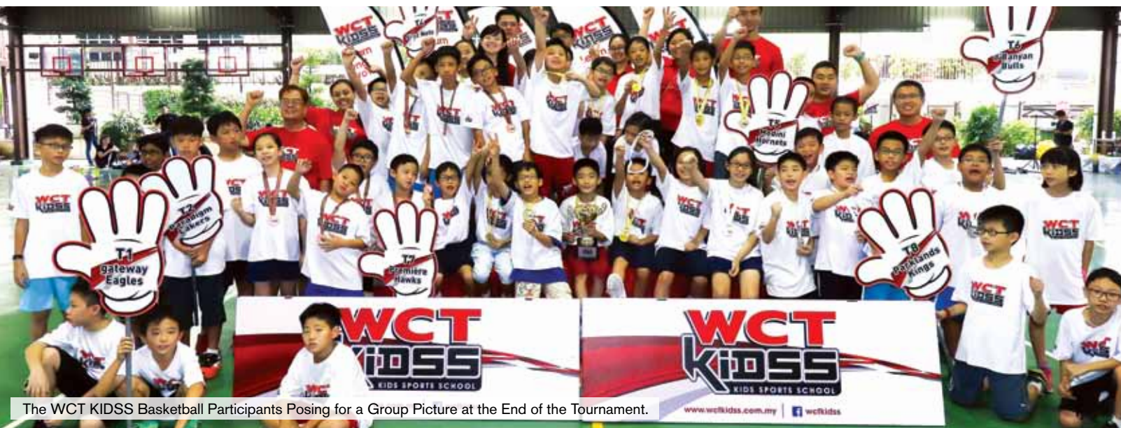
The WCT KIDSS Basketball Participants Posing for a Group Picture at the End of the Tournament.