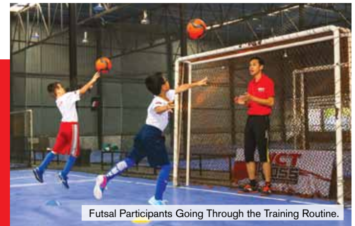
Futsal Participants Going Through the Training Routine.