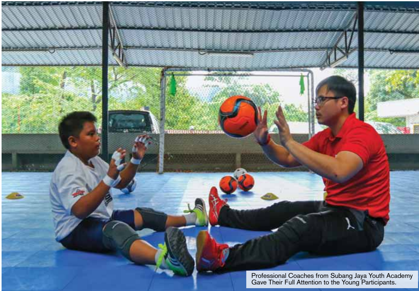
Professional Coaches from Subang Jaya Youth Academy Gave Their Full Attention to the Young Participants.