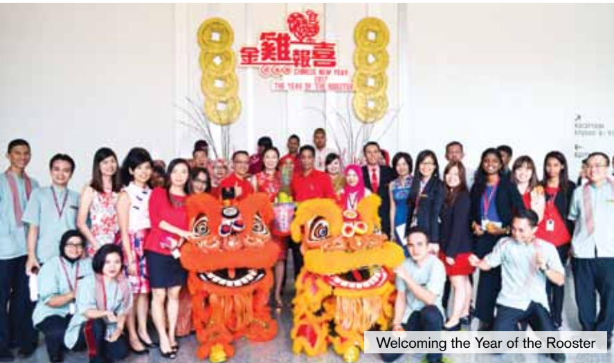
Welcoming the Year of the Rooster