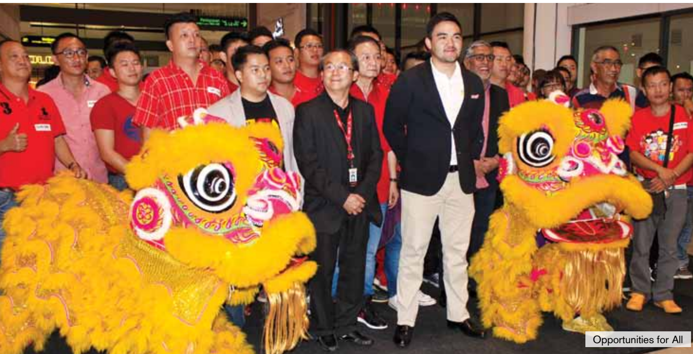
Opportunities for All