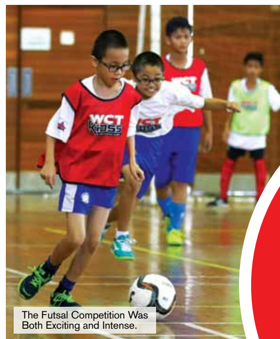
The Futsal Competition Was Both Exciting and Intense.