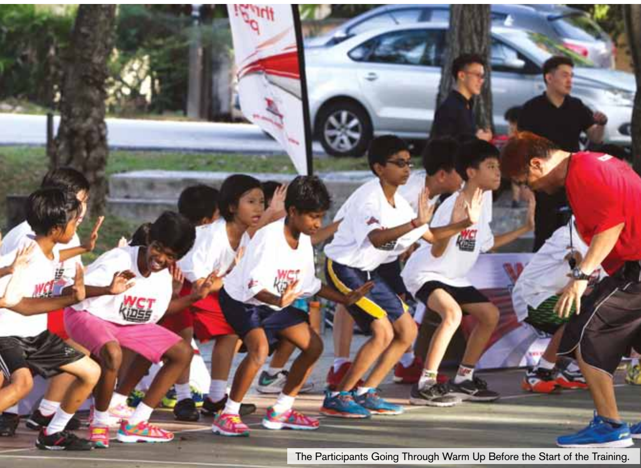
The Participants Going Through Warm Up Before the Start of the Training.