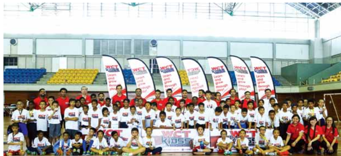
The WCT KIDSS Futsal Participants Posing for a Group Photo Together with the Coaches and WCT KIDSS Team at the End of the Tournament.