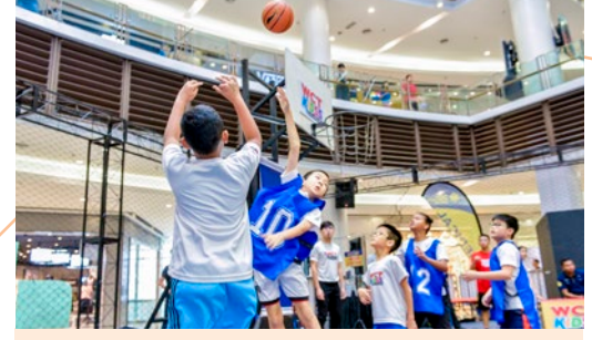
The kids showing off their impressive skills on the court.