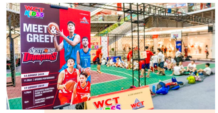
An exciting moment for the kids sports stars to meet their idols.

The participants were thrilled to meet their idols from Westports Malaysia Dragons. The children were also given an exclusive 2-hour basketball clinic in preparation for the 3-on-3 friendly basketball tournament.