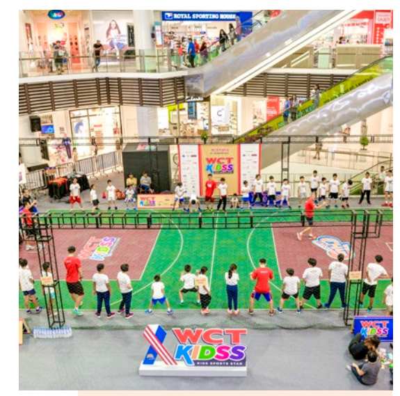
Warm-up session for the kids sports stars in the specially-designed basketball court .