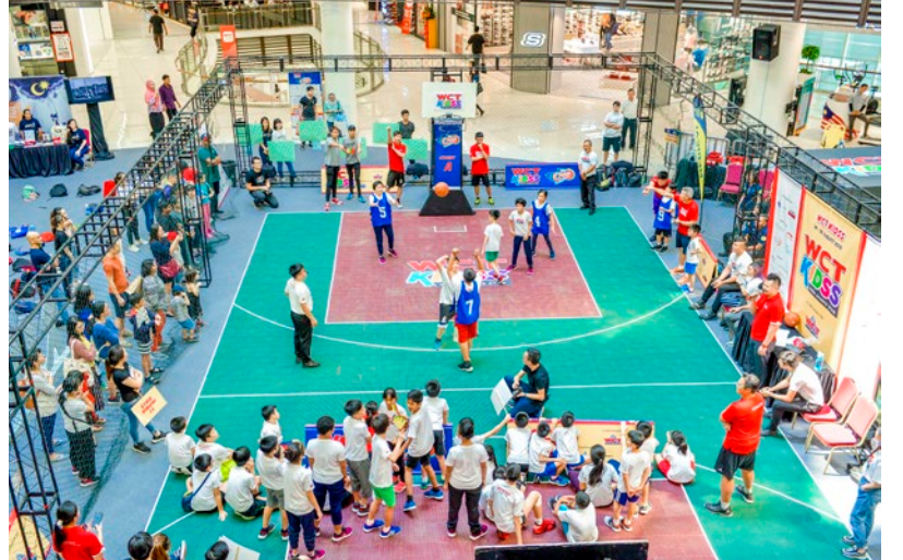
The kids giving their all as the crowd look on.