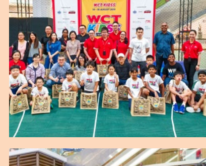
Participants' and Winners' Corner

The winners of the fun basketball challenges walked home with an attractive goodie bag of sponsored merchandises and exclusive vouchers courtesy of Paradigm Mall PJ's tenants.