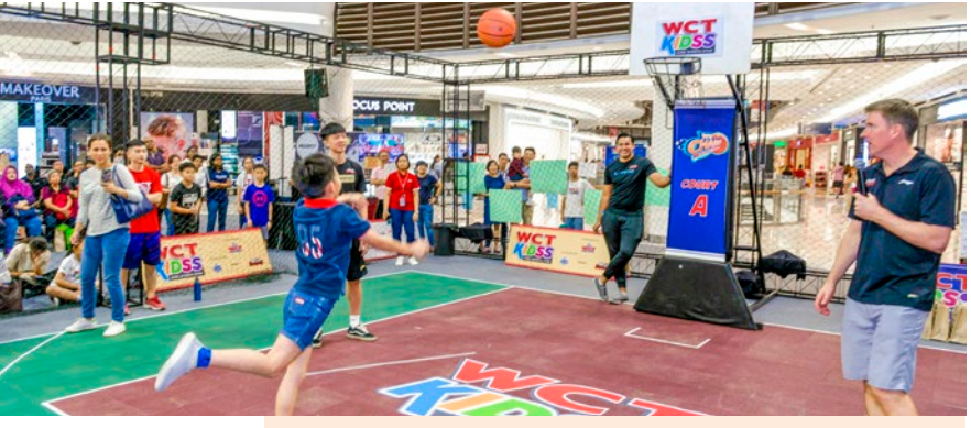
Shoppers enjoying the Basketball Dribbling and Shooting Challenges.