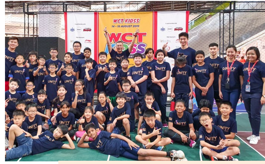
The participants donned the Projek57 Unity Tee on Day 2 of the programme.