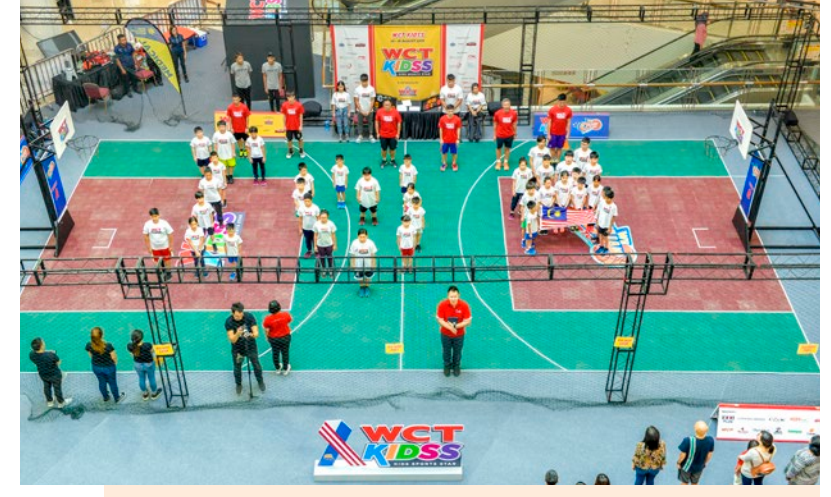
Coaches from ASBA leading the National Anthem, Negaraku before the start of 3-on-3 tournament in support of the spirit of patriotism and unity.