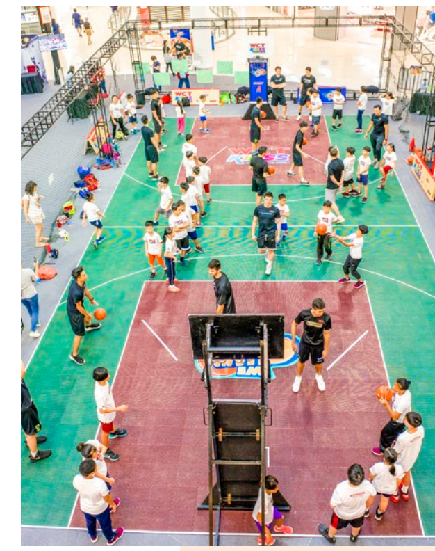
Basketball skills practice with their idols.