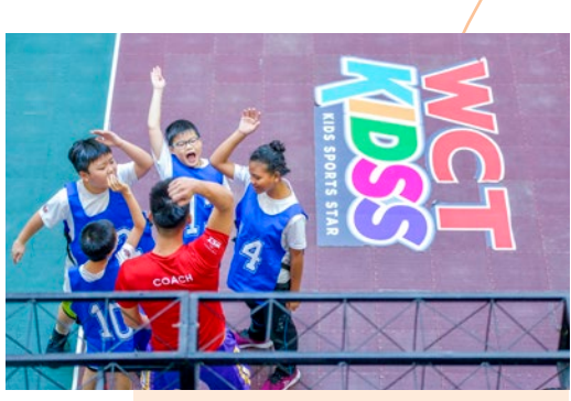
Teamwork makes the dream work.