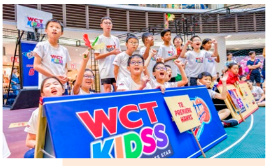
The children cheering for the players from the sideline during the tournament.