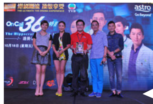
18 October: A meet & greet session with the hit TVB Medical Drama Series - On Call 36 Hours II with main casts - Lawrence Ng, Tavia Yeung, Mandy Wong and Benjamin Yuen.