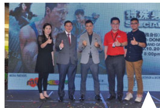
10 October: Special ID Movie Promo Tour with martial artist and Hong Kong action star Donnie Yen.