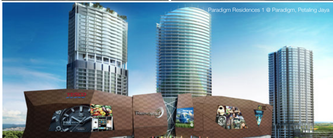
Paradigm Residences 1 @ Paradigm, Petaling Jaya