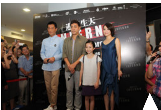
29 September: Inferno Movie Promo Tour with Hong Kong actors Sean Lau Ching Wan and Louis Koo along with Malaysian actresses Lee Sinje and Crystal Lee.