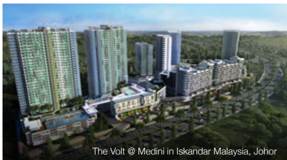
The Volt @ Medini in Iskandar Malaysia, Johor

2014 is an exciting time for WCT as it plans to launch three projects in choice locations. Among a strong line-up of anticipated new launches are Paradigm Residences 1 @ Paradigm in Petaling Jaya, Skyz Jelutong Residences @ Bukit Jelutong in Shah Alam and The Volt @ Medini in Iskandar Malaysia, Johor.