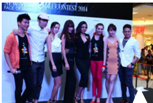
8 September: Asia New Star Model Search – Face of Malaysia 2014. Among the panel of esteemed judges present were Amber Chia, Soo Wincci and Nadine Ann Thomas.

As one of Petaling Jaya's most happening shopping, dining and entertainment hubs, Paradigm Mall hosted over 120 events including celebrity appearances, charitable initiatives, movie premieres and product launches. Celebrity sightings were the buzz among shoppers at the lifestyle mall.