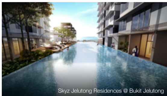
Skyz Jelutong Residences @ Bukit Jelutong