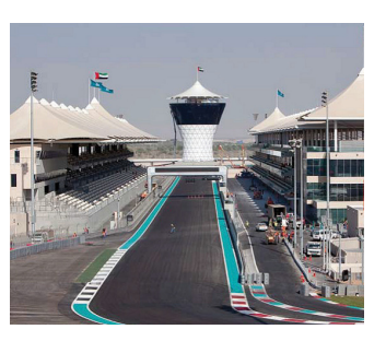
Yas Marina F1 Circuit. Abu Dhabi, UAE

Achieved accumulated property sales of RM2 billion.